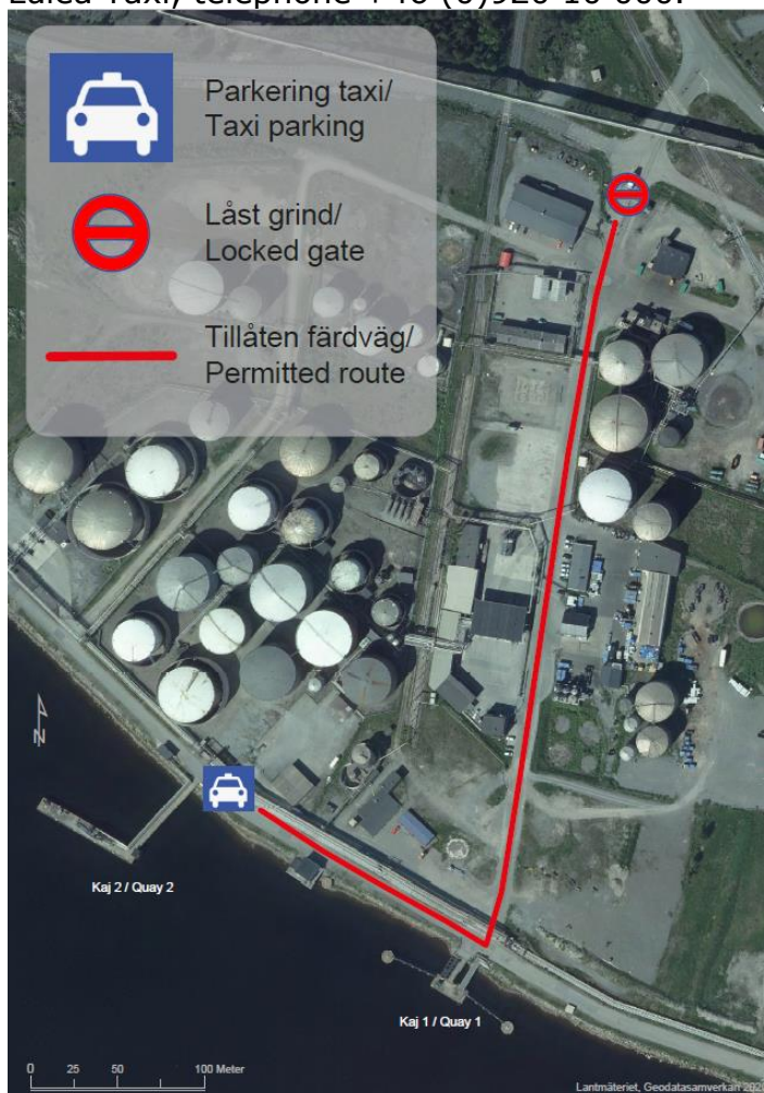
Figure 1. Taxi route.